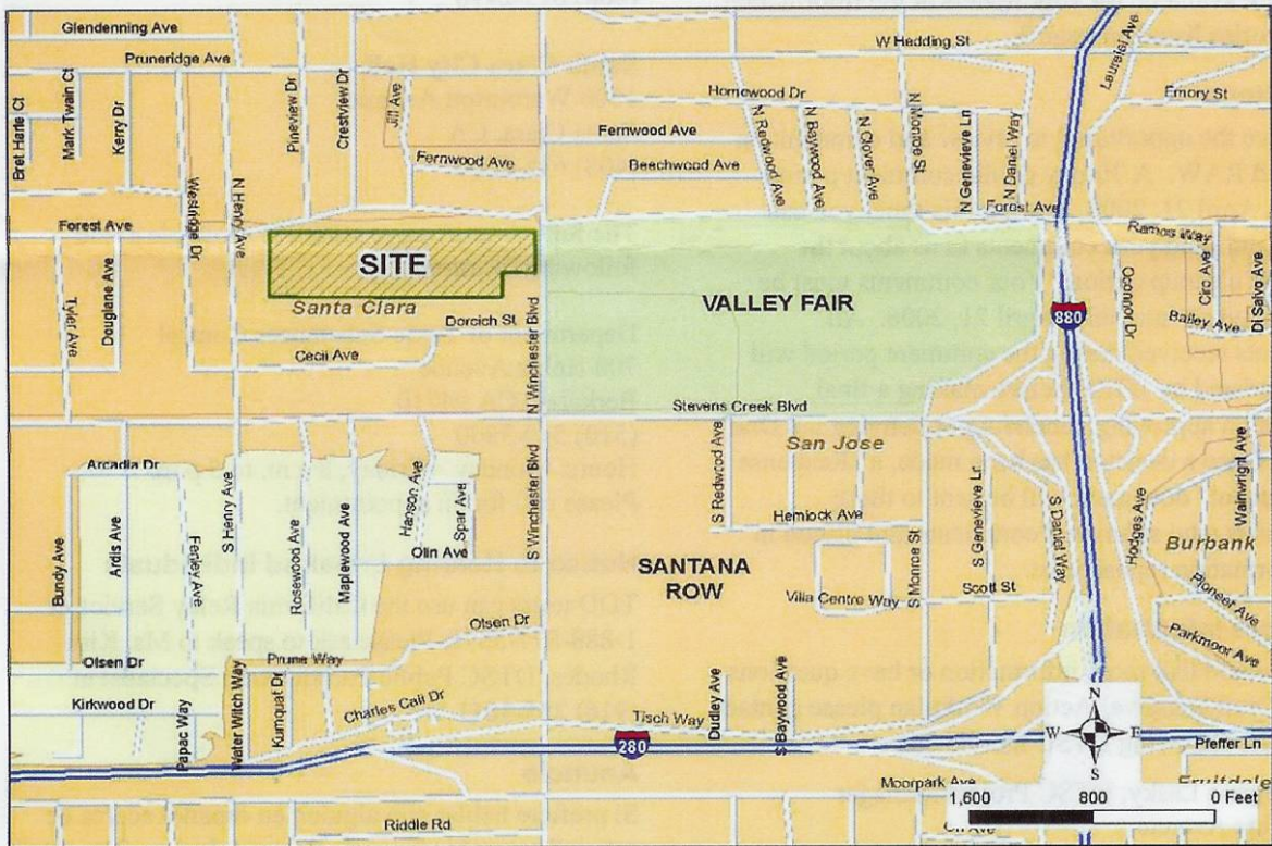
Bay Area Research Extension Center (Site), 90 North Winchester Boulevard, Santa Clara, CA